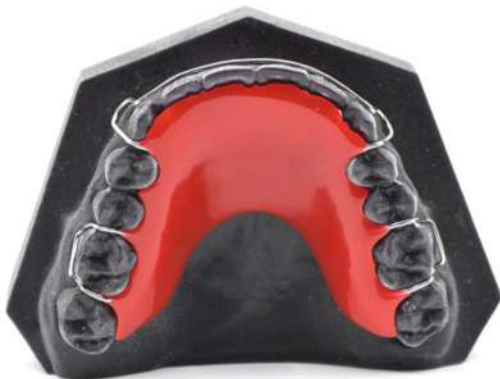
Standard upper retainer bow with Adams clasps

Customizable options for removable pediatric treatment