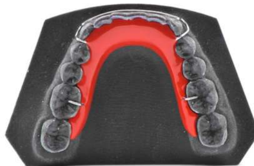
Standard lower retainer bow with molar rests

Removable appliances allow for orthodontic or pre-orthodontic treatment without fixing the appliance in the patient's mouth. Common removable appliances for pediatric treatment often include our standard retainers or an invisible Theroux option, both trimmed away from erupting teeth, and can include optional functions like bite plates, springs, or even expansion screws.