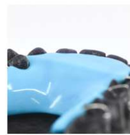
Ant. Bite Plate