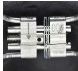
NiTi spring screws