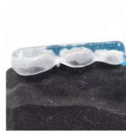
Post. Bite Plate

Commonly used together to push anterior teeth out of crossbite