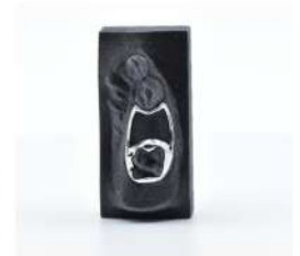
Band and Loop