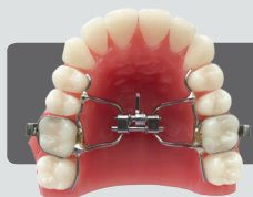
BANDED 4 ARM DESIGN