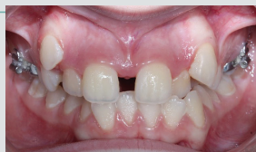
After the expansion with KKE