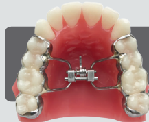
3D METAL PRINTED DESIGN