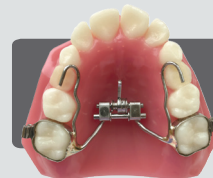
MIXED DENTITION 2 ARM DESIGN