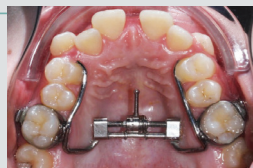
After the expansion with KKE